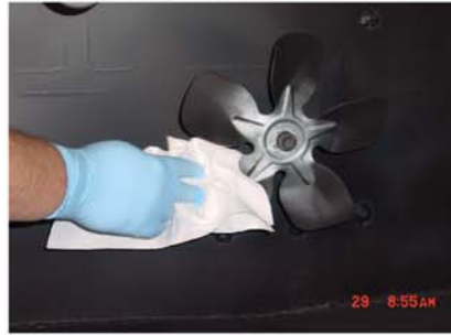
Step 5 - Clean the Fan Assembly(s) Completely. Check for Signs of Imbalance or Irregularities.