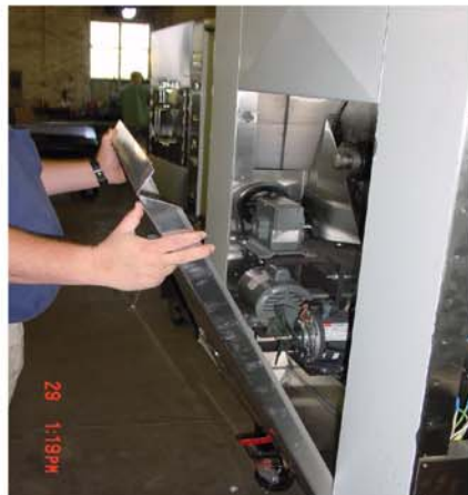
Step 8 - Remove Convection System Access Panel. Carefully Lift Out & Lift Up.