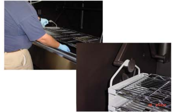
Step 6 - Reinstall the Rack Configurations, so that they Rest Correctly on the Trunion.