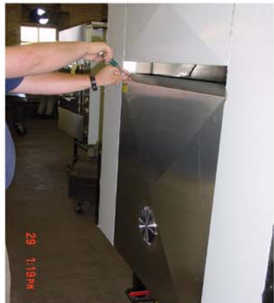
Step 7 - Remove Screws to Convection System Access Panel.