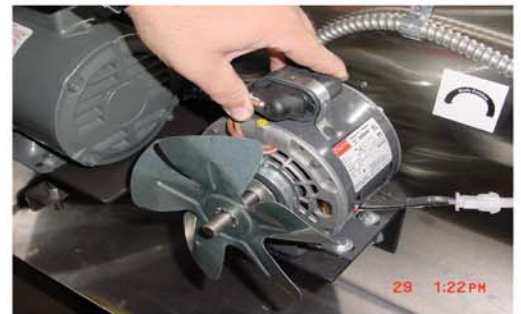
Step 9 - Clean Fan Blades as needed and check for Signs of Imbalance or Irregularities.