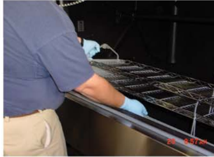
Step 2 - Remove (2) Rack Sets.