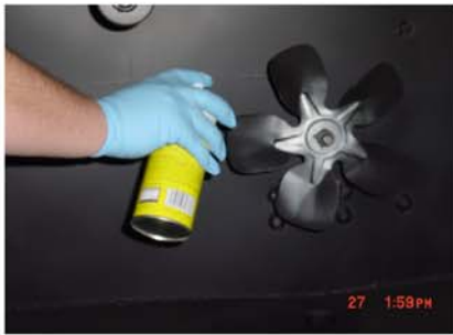
Step 4 - Spray Both Sides of Fans with Degreaser/Cleaner.