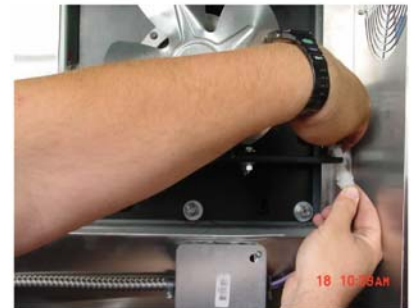
Step 3 - Unplug the Quick Disconnect.