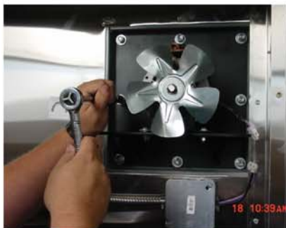
Step 4 - Loosen Nuts from the Convection Fan Motor Mount(s).