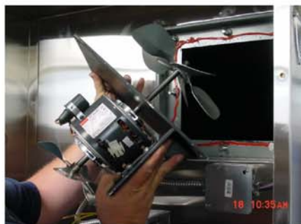
Step 7 - Slowly Remove the Convection Fan Assembly(s).