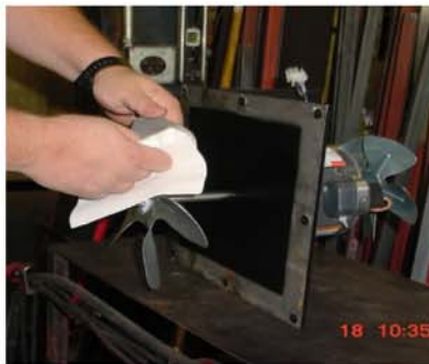
Step 8. - Clean Fan Assembly(s) Completely. Check Set Screws and Inspect Blades for Signs of Imbalance or Irregularities. You are now ready to reassemble.