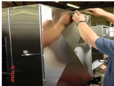
Step 2 - Remove Service Panel Located at the Back of the Unit.