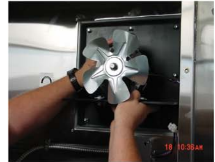
Step 6 - Place a Firm Hold on the Motor Mount & Motor...